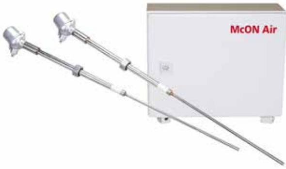
Figure 1. McON Air.