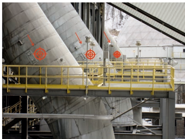
Figure 4. St Genevieve Measurement of air flows on all finished product mills.