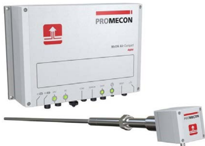
Figure 3. Gas Flow Measurement System McON Air Compact.

The last big aspect of the measurement – namely the swirl of the flow – is taken care of by the fact that the sensor measures the gas velocity as a vector. The two antennas are installed parallel to each other along the flow path of the gas. The algorithm, which compares the patterns of the two sensors, comes up with a time shift of gas flow between sensor 1 and sensor 2. The velocity is subsequently calculated by dividing the distance between the two sensors by the timeshift measured. The distance between the sensors, however, is a vector that stands orthogonal on both antenna rods. Hence the calculated velocity is the vector that stands orthogonal on both sensors. As the sensors are mounted perpendicular to the duct's longitudinal axis, the measured velocity is the one along that axis. Any lateral or azimuthal component of the velocity is ignored by the measurement. This is one of the strongest aspects of this type of measurement. Not only in large ducts but also in stack