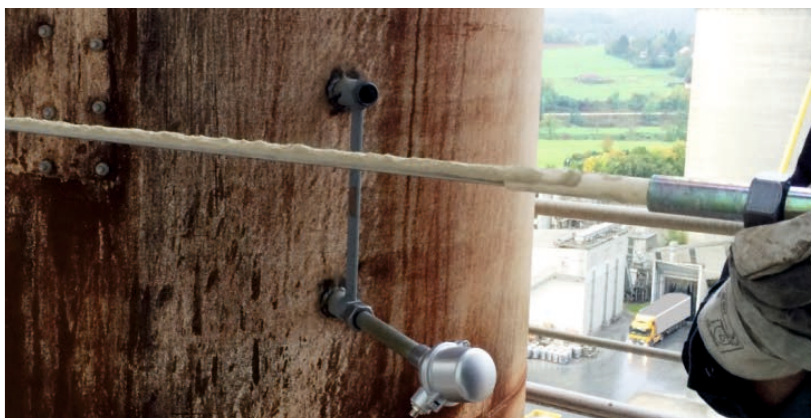
Figure 2. Dust covered sensor – its accuracy is unaffected.